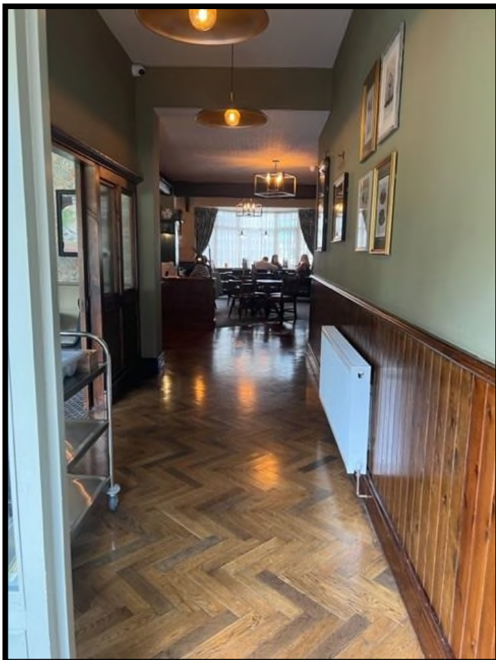
11. Route from garden to bar