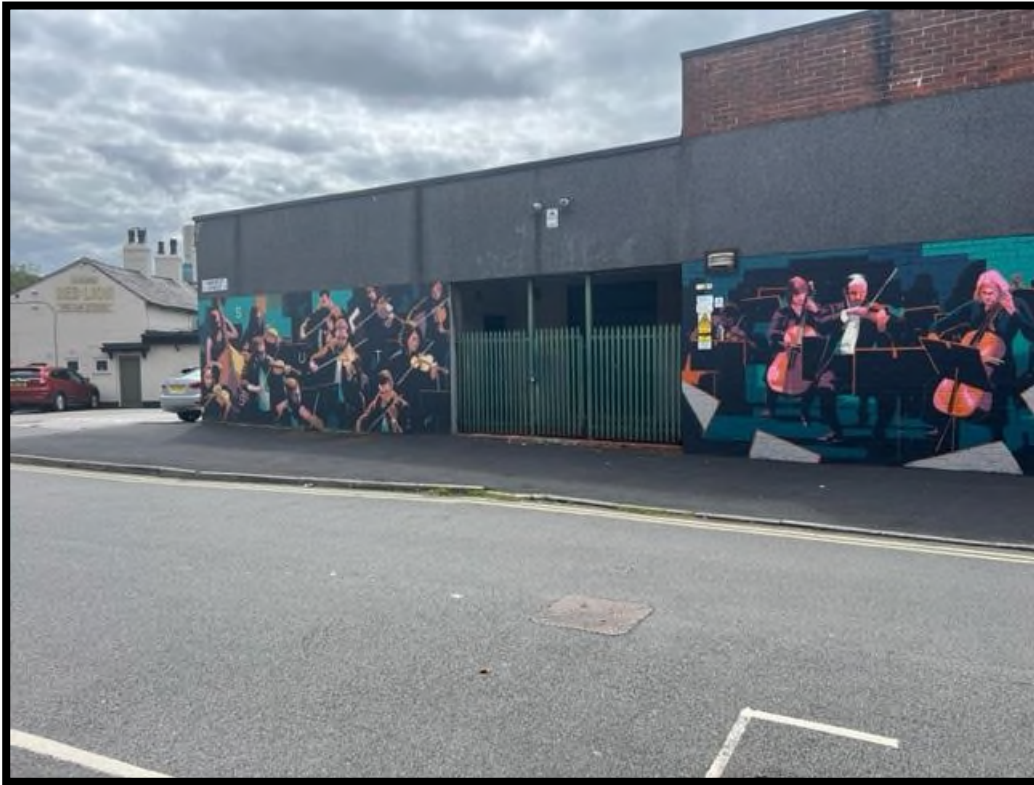
7. Marriot St Substation