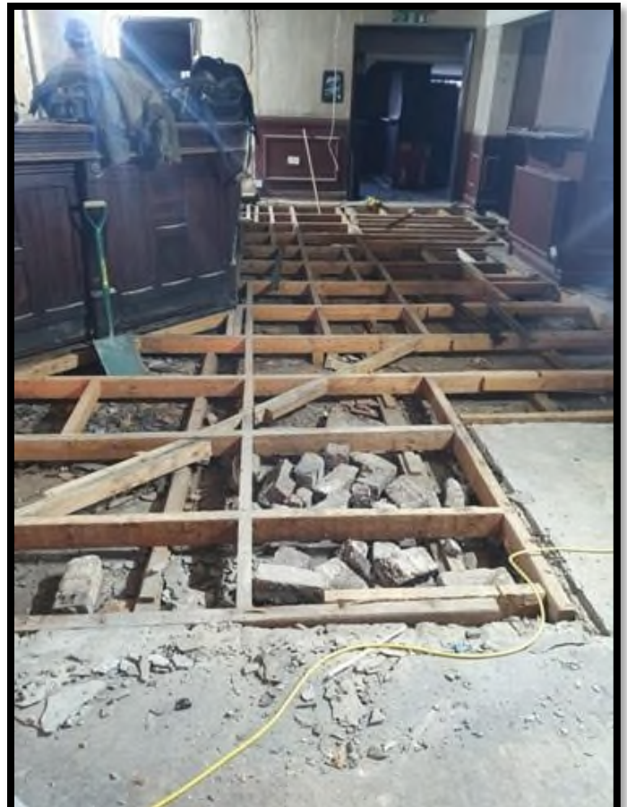
3. Structural works during refurbishment