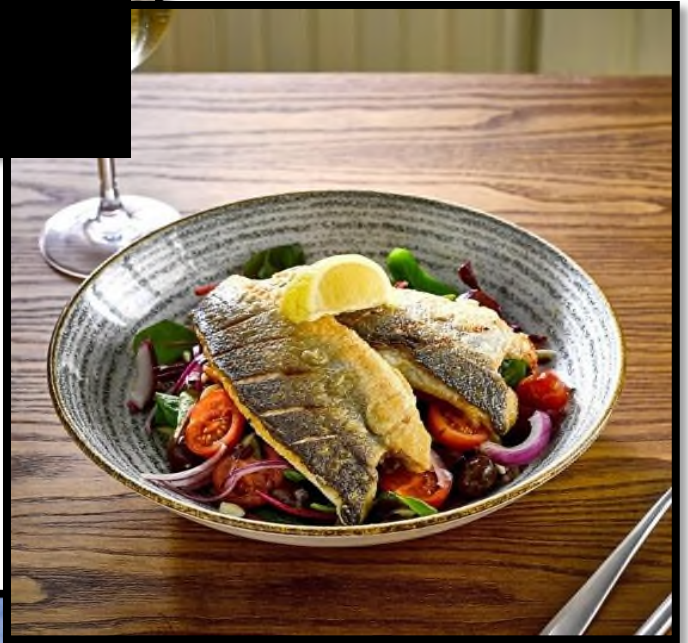
5. Sample Menu Item