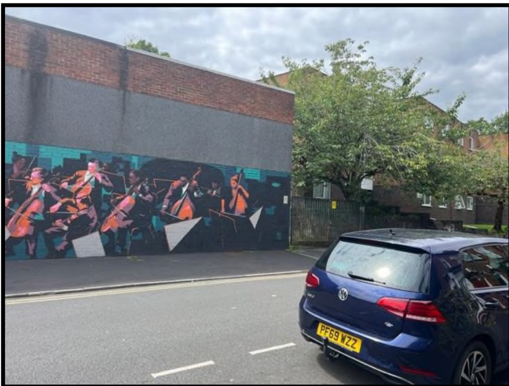
8. Marriot St Substation