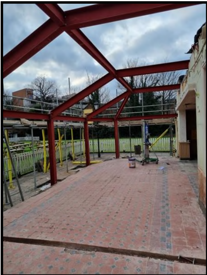
2. Conservatory area under renovation