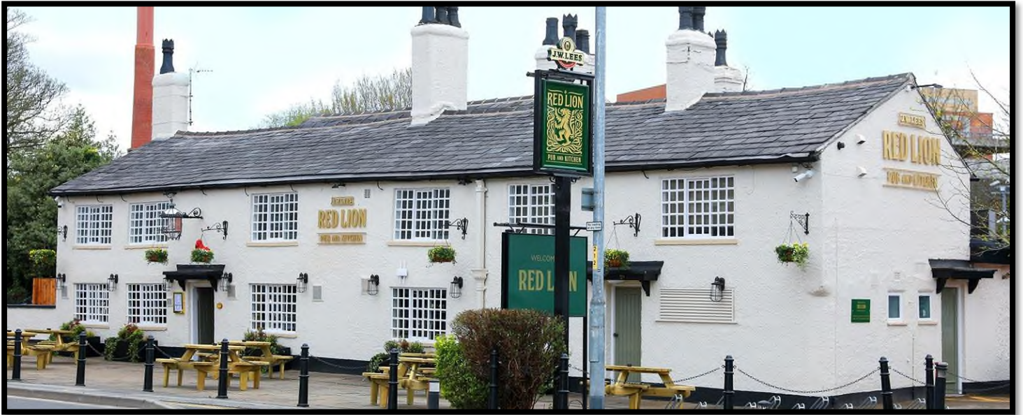
1. The Red Lion, Withington