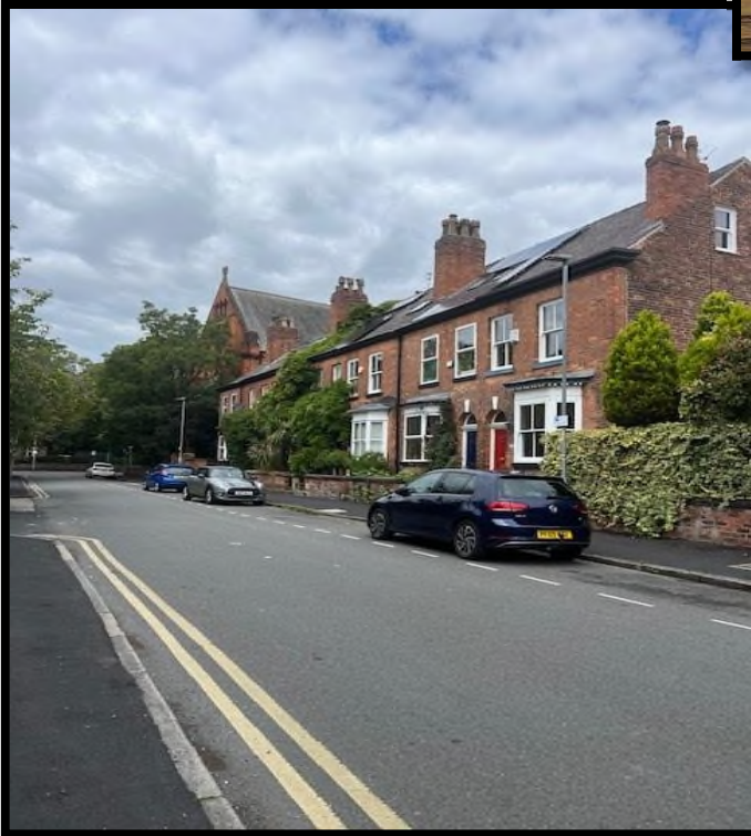
6. Marriot St (North Side)