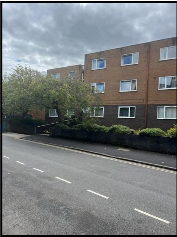
9. Marriot St (South side) Parsonage Court